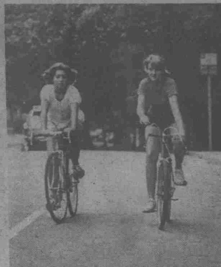
Chapel Hill bike accidents on the rise ... police to crack down on offenders

"We don't want to have to write tickets. We just want compliance with the bike ordinance and the motor vehicle laws."