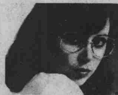
121 E. Franklin St. Phone: 942-3254

Phone: 968-4408 HOURS: Mon.-Sat. 10-6:30; Sun. 1-5 163 E. Franklin St., Downtown Chapel Hill Cupboards also in Greensboro & Charlotte FREE VALIDATED PARKING