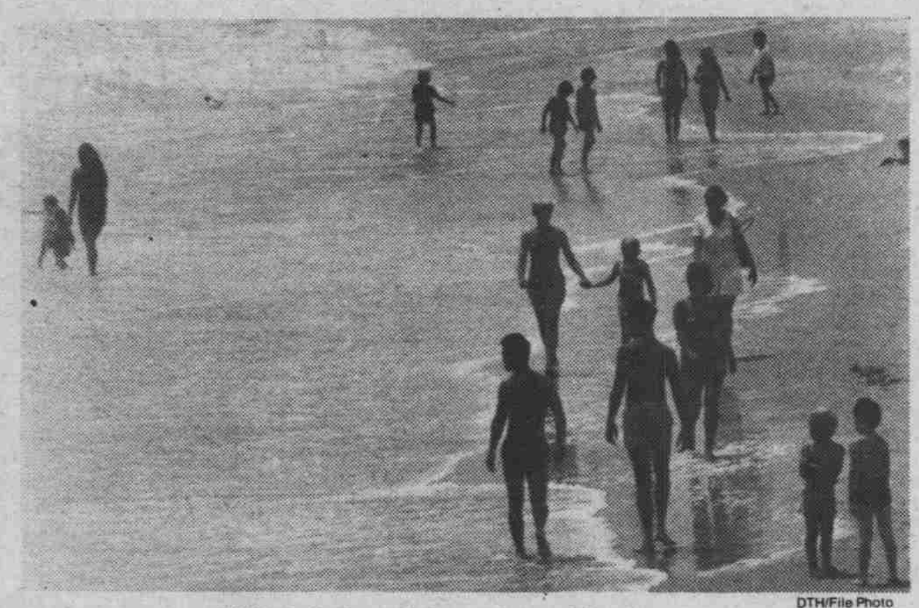
UNC students seek fun and sun at beaches ... flock to Florida for Spring Break