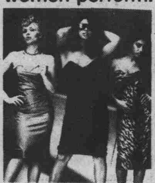
Prince - The Time - Vanity 6 Feb. 15 — Carmichael Aud. TICKETS ON SALE AT UNION BOX OFFICE (962-1449)

We dare you to come see these women perform.