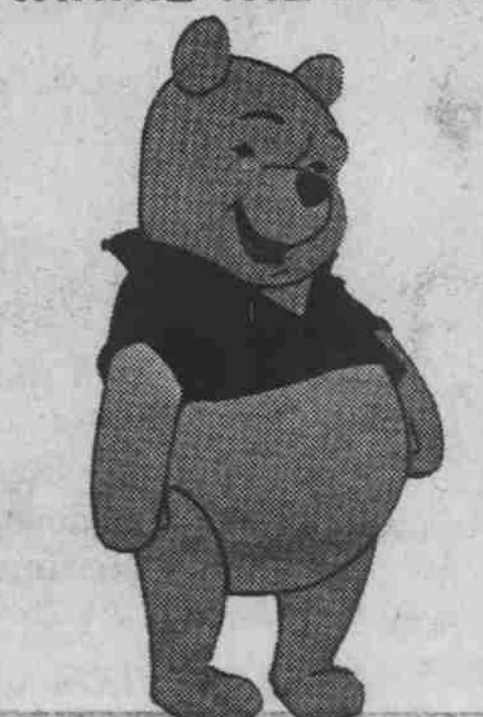
Saturday, February 12 11 am & 1 pm 50¢ at Union Desk

We dare you to come see these women perform.