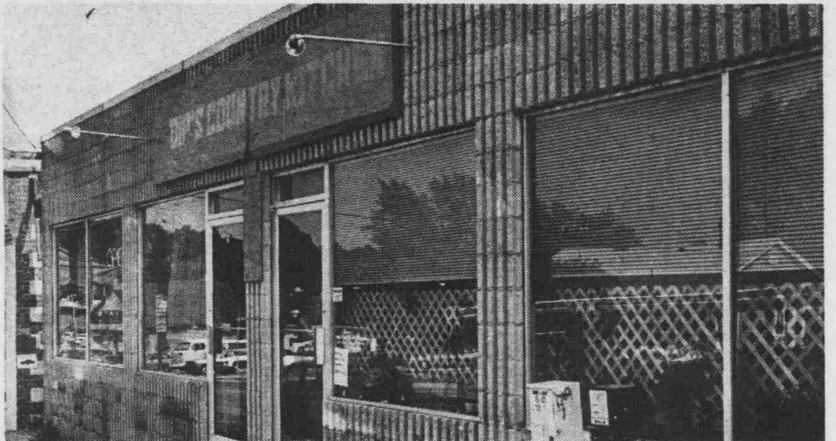
Garden fresh vegetables and home-cooked meals are specialties at Dip's Country Kitchen.

A&J's specialty is barbecue, and it is said to be some of the best in Orange County. You can judge that for yourself and when you do you'll get enough vegetables for a balanced meal that even the most particular mother would appreciate. A&J, which is open until 9 p.m., doesn't take checks, but then neither did Mom. This restaurant is a must-try before you graduate.