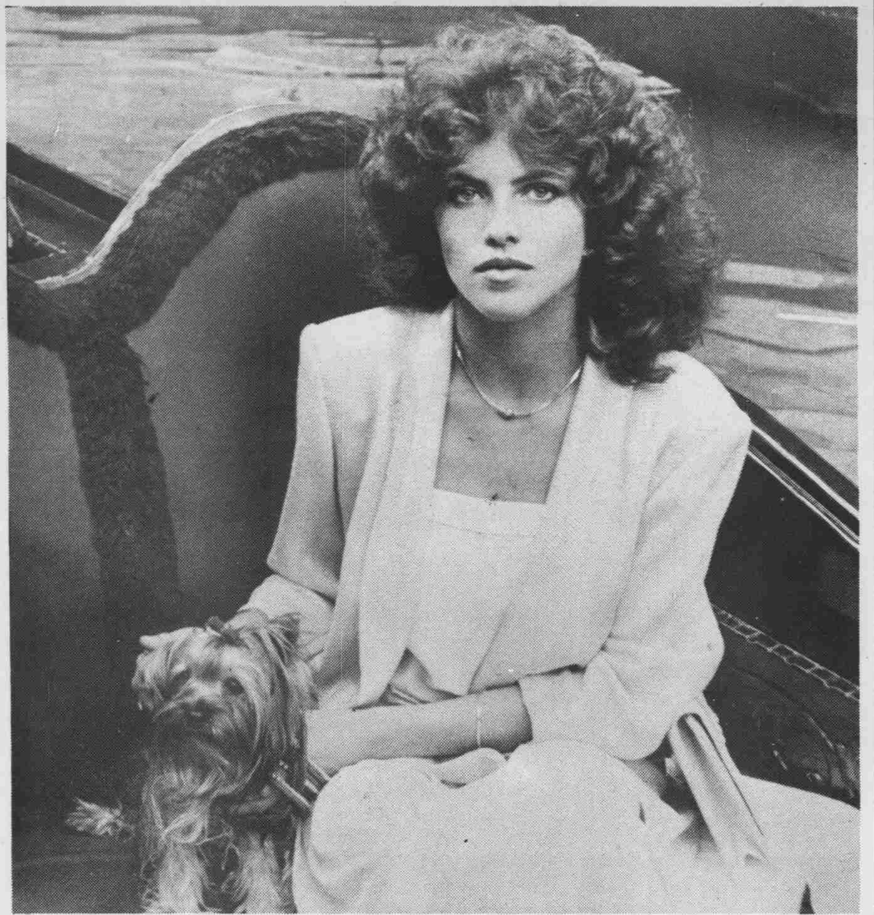
Venice, the city of romance, is the setting for 'The Gift' starring international sensation Clio Goldsmith as Barbara, a very special gift. It also stars Pierre Mondy and Claudia Cardinale.

The major fault in The Gift is its reliance on people laughing as a plot resolution - a dead giveaway to sloppy craftsmanship.