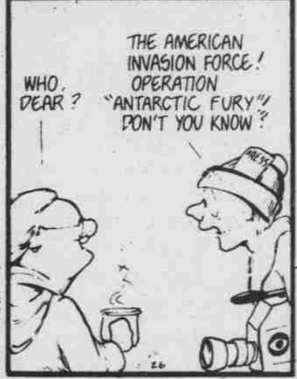
EXCUSÉ ME. I'M WITH A CBS FILM CREW...WE'VE JUST ROWED IN FROM NEW ZEALAND. ARE THEY HERE