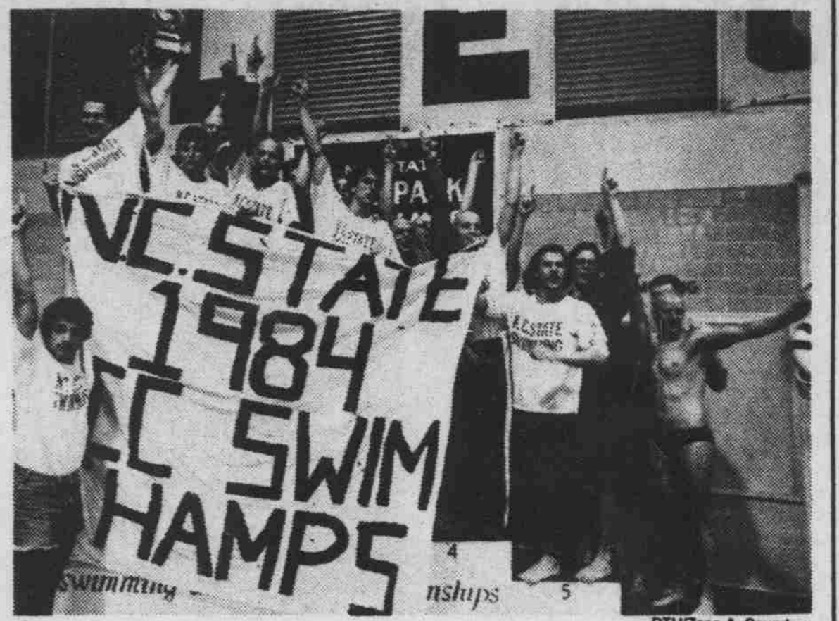
N.C. State avenged last year's loss in the ACC swimming championships, its first in 12 years, with a win this weekend.