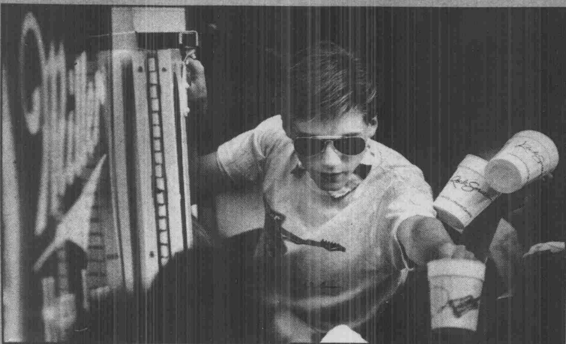
The 75 kegs went fast even by the cupfull.