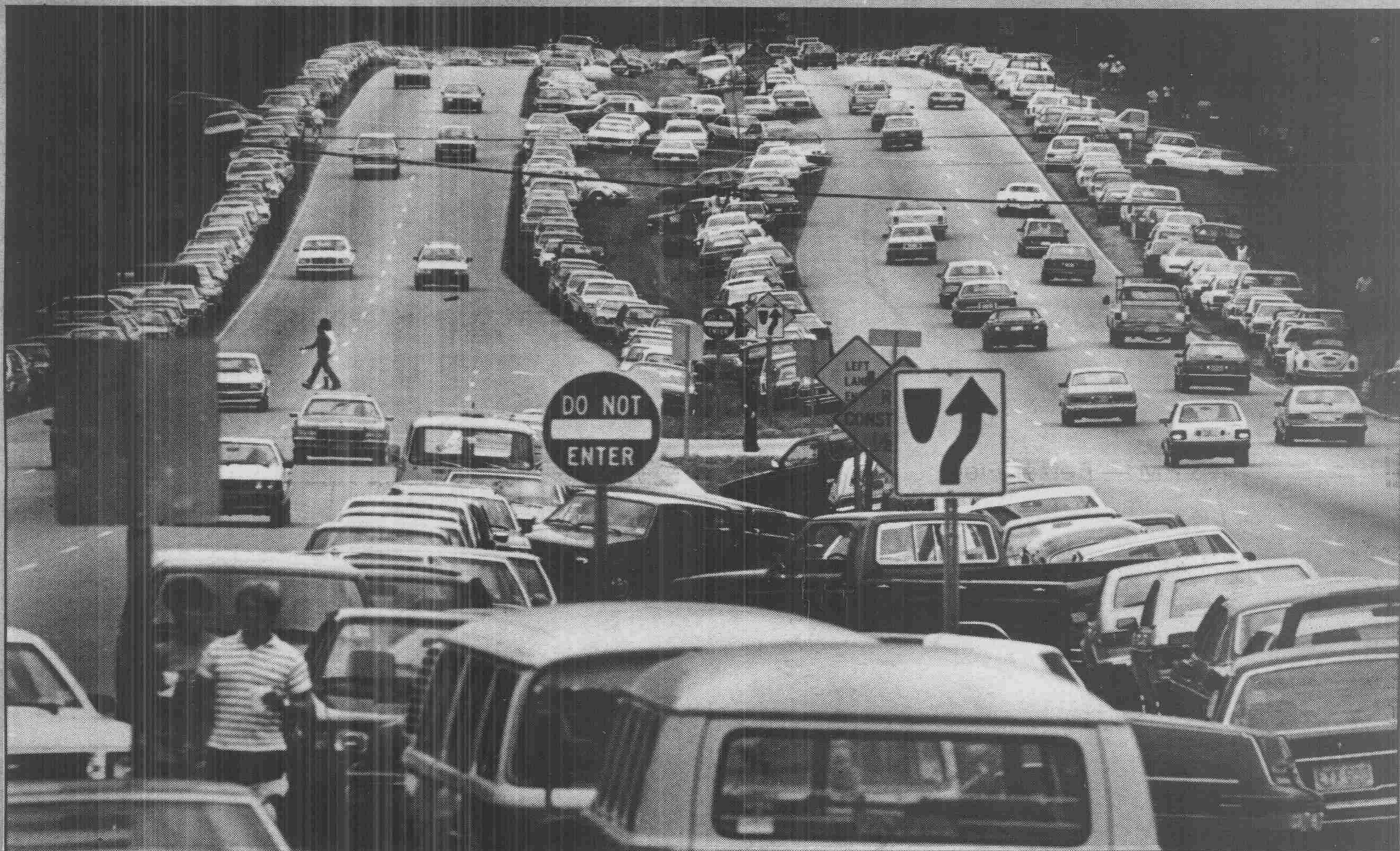
Cars were crammed into every available inch along N.C. 54. Some people had to park more than a mile away from the party.