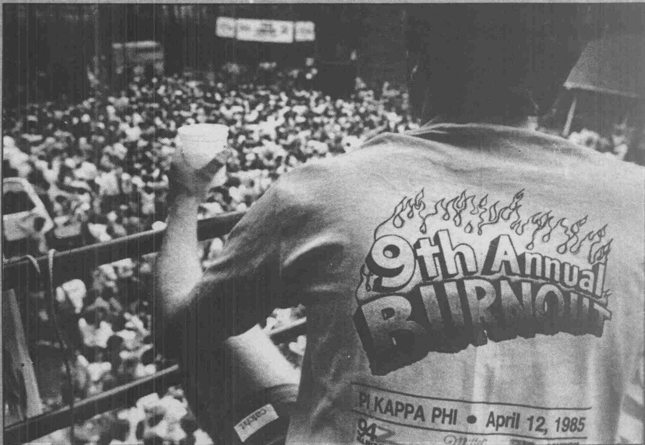
The Ninth Annual Burnout is history. We have only next April to look forward to.