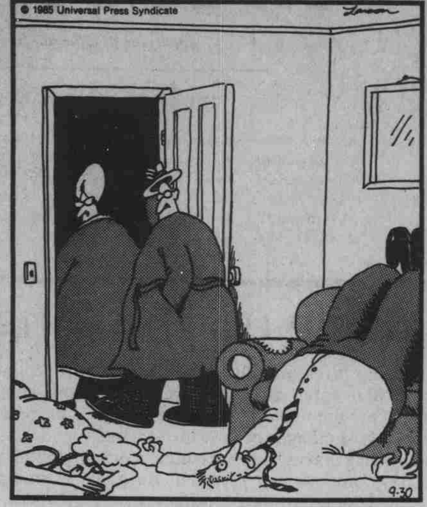
The Arnolds feign death until the Wagners, sensing the sudden awkwardness, are compelled to leave.