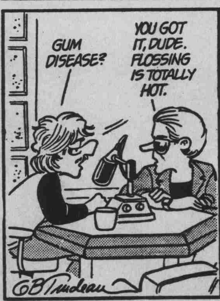
C. 1985. G.B. Trudeau Reprinted with Permission of Universal Press Syndicate. All rights Reserved.

So says Doonesbury and The School of Dentistry! We invite you to attend a mini-series designed to acquaint you with the changing field of dental hygiene.