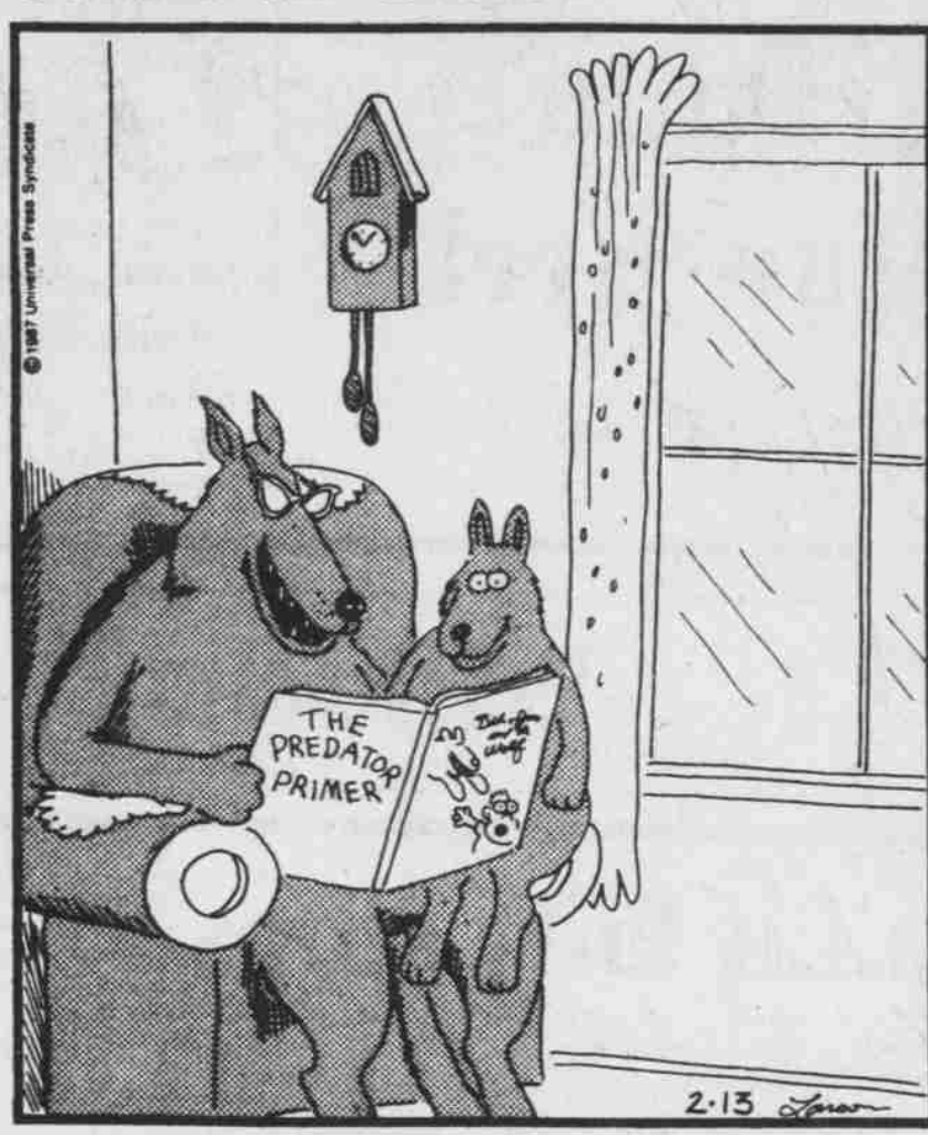
"See Dick run. See Jane run. Run run run. See the wolves chase Dick and Jane. Chase chase chase. ..."