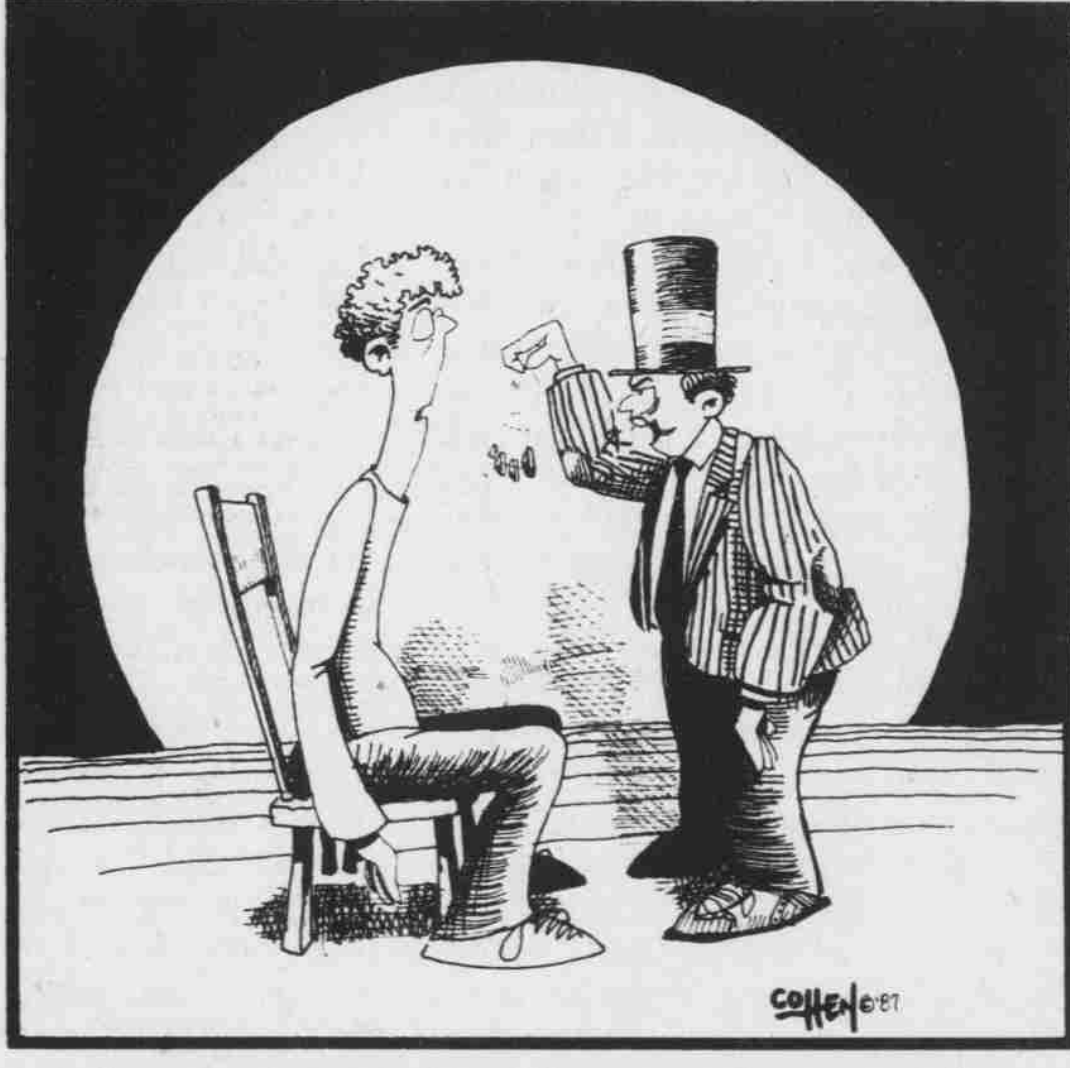
". . . you are now asleep. When you wake up, you will have bad breath, and you will be irritable, and there will be crust in your eyes . . ."