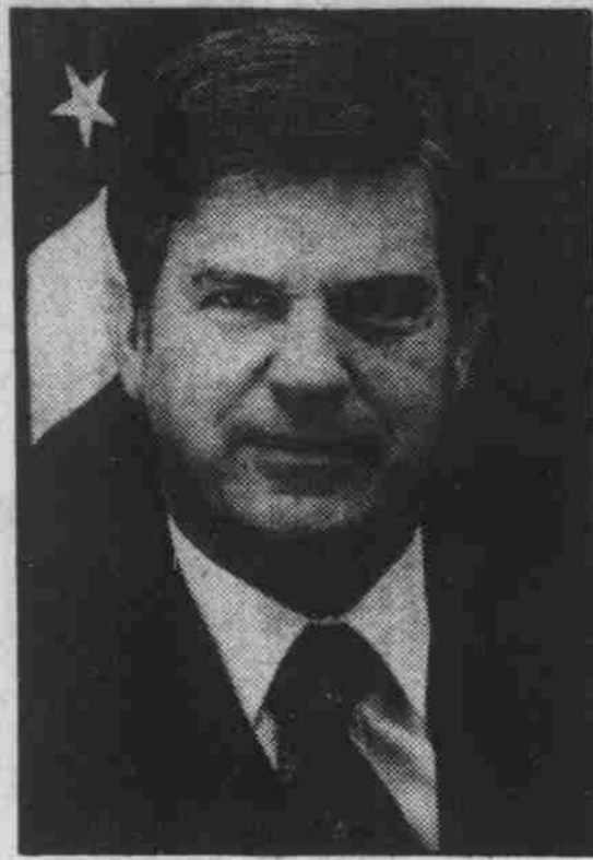
Gov. Jim Martin