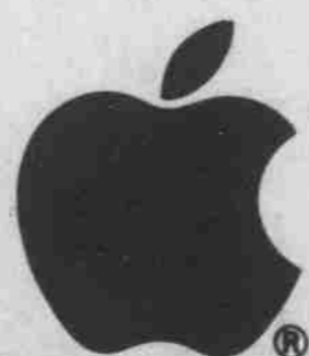
Apple logo is a trademark of Apple Computer, Inc. Macintosh is a trademark of Macintosh Laboratory, Inc.

14K 14K LAST DAY! THE GOLD CONNECTION 3rd Anniversary SALE 20%-25% OFF EVERYTHING DON'T MISS OUT! 128 E. Franklin St. Downtown Chapel Hill 967-GOLD 14K 14K