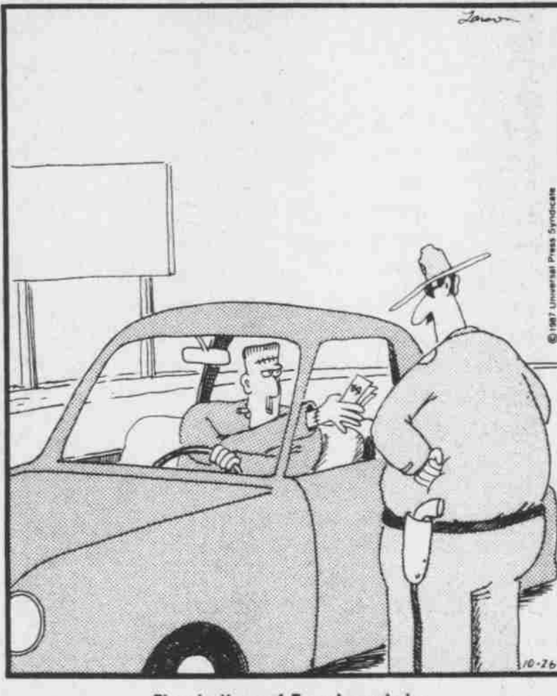
The bribe of Frankenstein