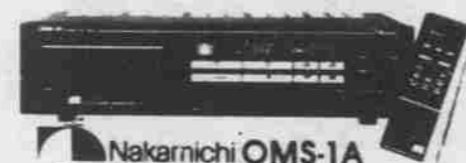
Nakamichi OMS-1A Compact Disc Player

New! Nakamichi quality at a bargain price. Includes remote control.