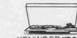
KENWOOD KD26 Turntable

Belt drive, autoreverse with cartridge. Reg. $140.