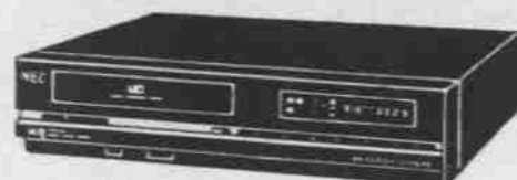
NEC 916 VHS VCR

Better Components • Better Service • Better Prices • Better Get Moving