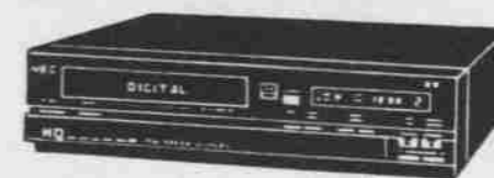
NEC DX1000 Digital VHS VCR

HQ. digital, special effects, 21-day, 4-event on-screen timer, wireless remote control and more. Reg. $549.