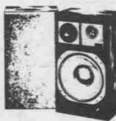
KENWOOD JL460 Speakers Reg. $150/pr.