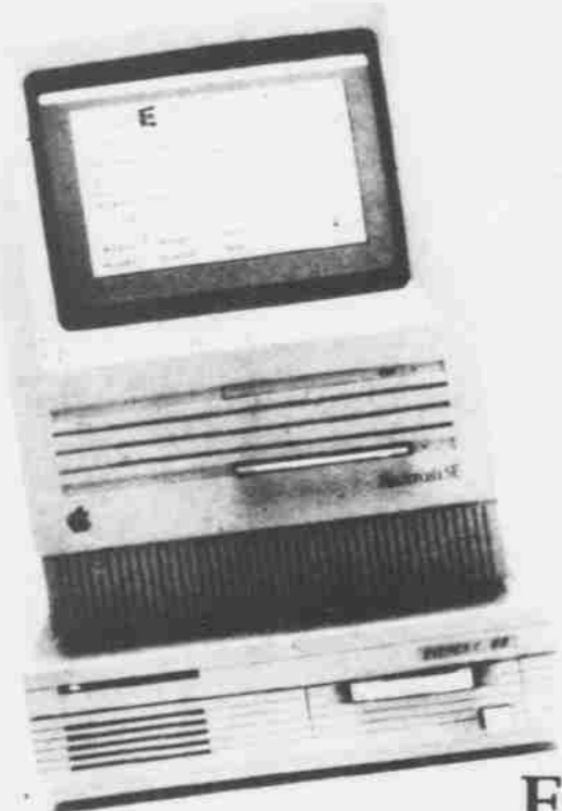
EMAC-D Hard Disk Drives

Be one of the first 100 people in the RAM Shop on April 15th to preview the EMAC line of MAC compatible peripherals and receive a FREE EVEREX T-SHIRT!