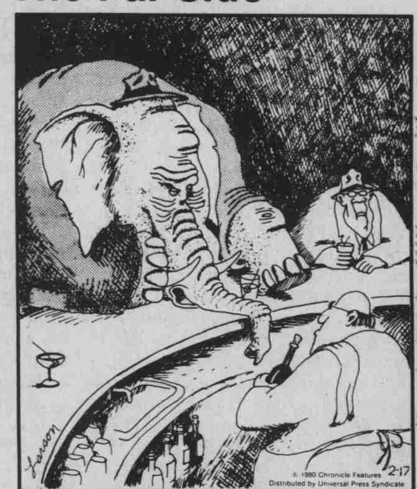
"It's no use. I drink and I drink... and I still can't forget."

The Senior Class of 1989 is offering a SKI TRIP to Massanutten & Wintergreen 2 days/1 night Feb. 25 & 26. Package includes: Roundtrip deluxe motorcoach transportation, Lodging at the Regency Inn at Harrisburg, VA, Saturday lift ticket at Massanutten, Sunday lift ticket at Wintergreen. Total Price $109 (4 skiers to a room) $25 due at time of booking. HURRY - Spaces are limited!