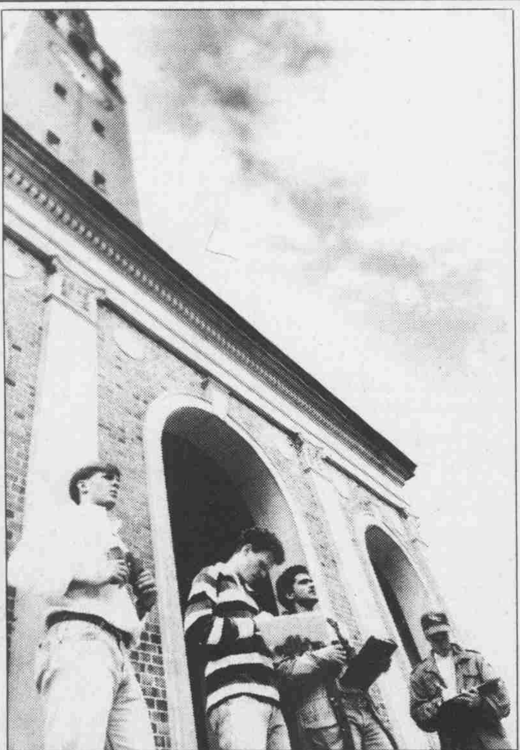
For whom the bell tolls

"My No. 1 duty is to report student concerns to the chancellor, and this is something I felt he needed to know."