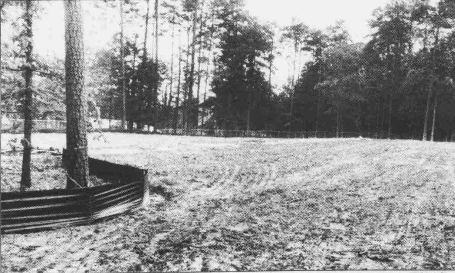
The Big Hole in The Big Woods: It's dangerous. It's ugly. It's the Alumni Center.

Most people just said no. "Only when they scream," was an answer with which we could all empathize. "I thought they were chemistry pro-