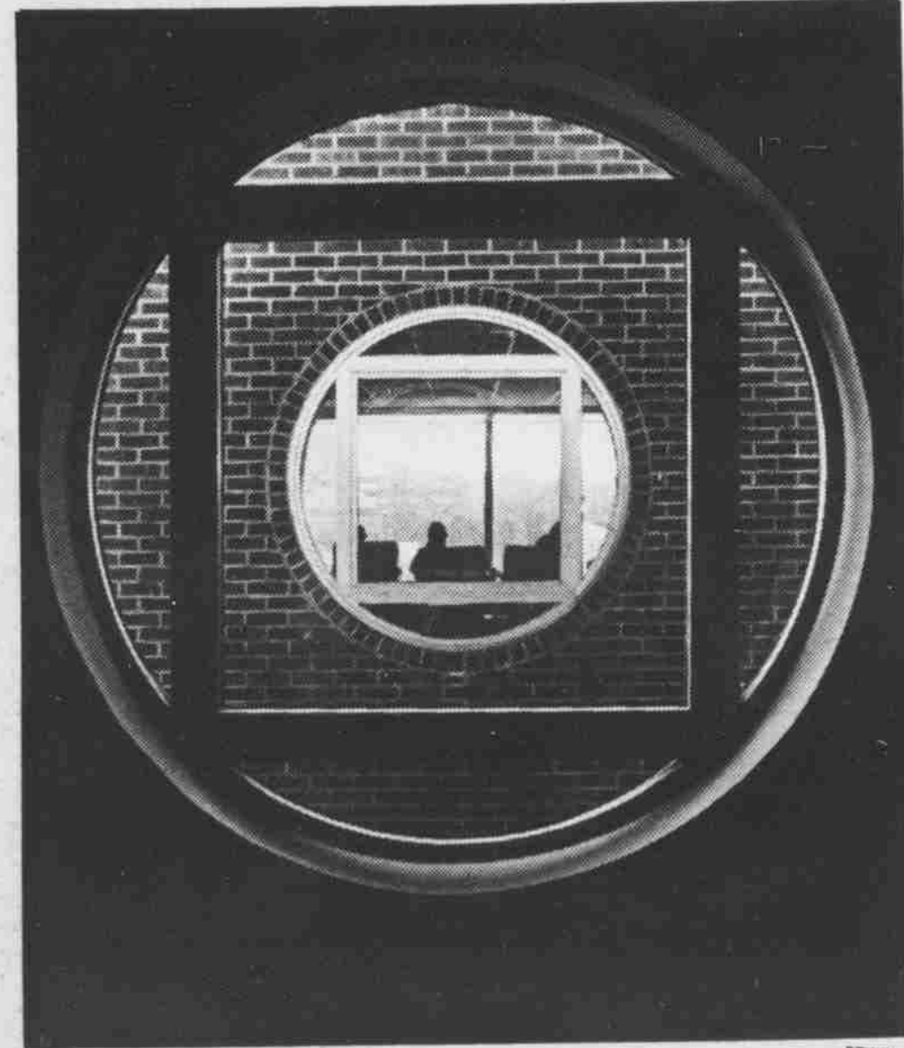
The gargantuan Davis Library is the place where we really go to study