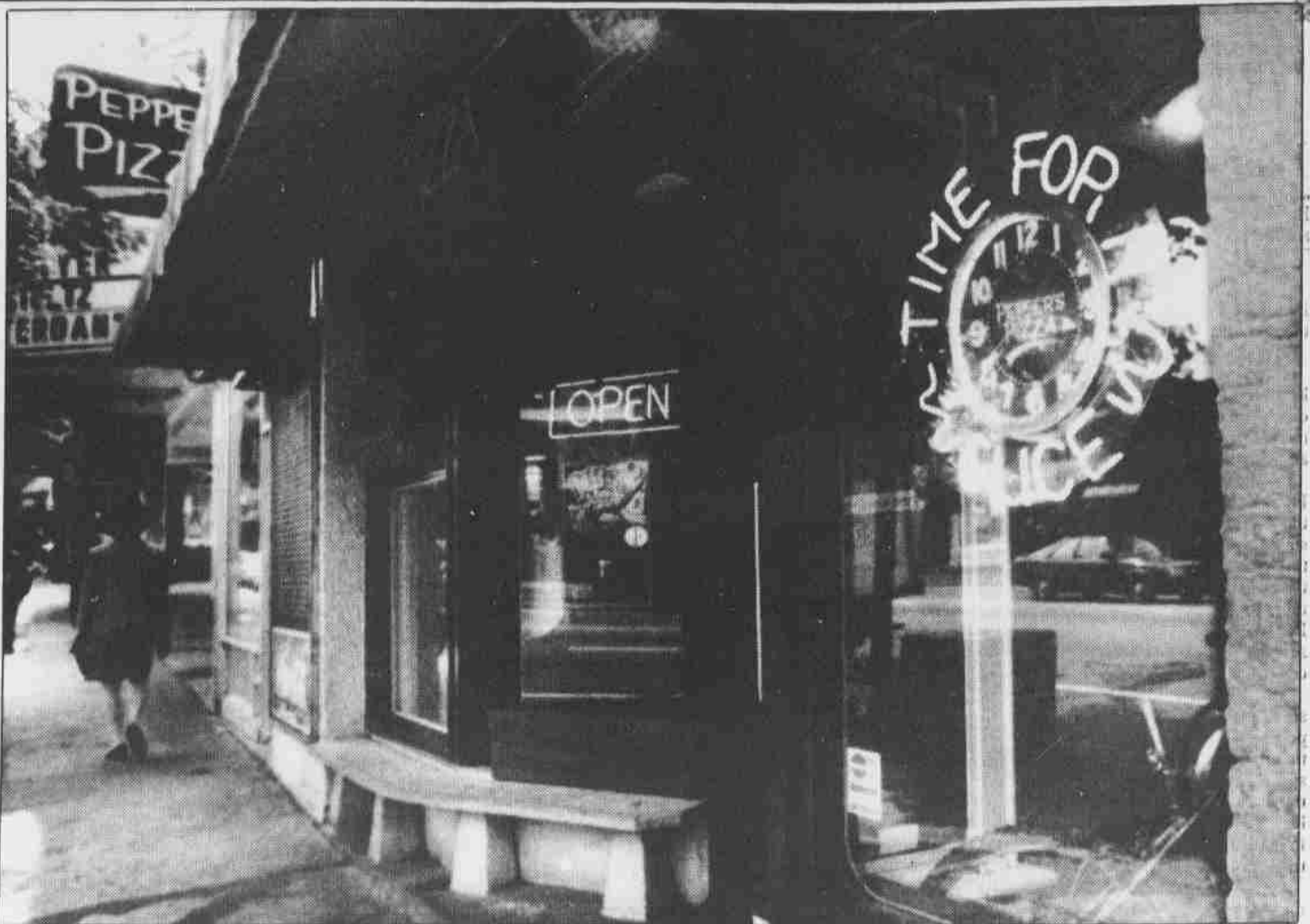
Pepper's Pizza, located at 127 E. Franklin St., serves it up fresh every day for hundreds of new and repeat customers