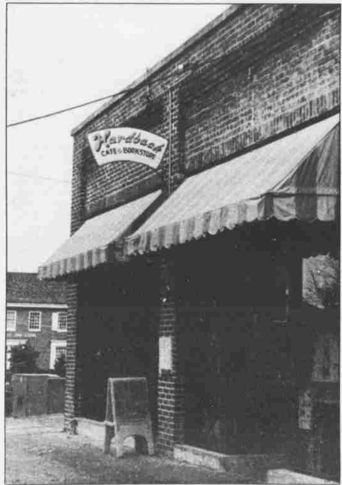
Just being weird isn't enough at the Hardback

Miami Subs offers a wide variety of items, serving up delicious (all the better if you're wasted) steak and cheese sandwiches, burgers, kaiser chickens, deli sandwiches, meatball heroes and gyros. The average meal runs from $4 to