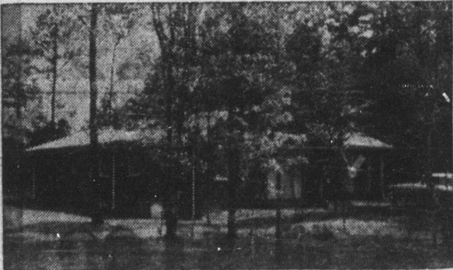
MEADOWBROOK ACRES $15,000

119 N. Columbia St. — Next to Western Union