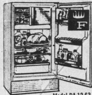
Model DA-12-63 11.6 cu. ft.