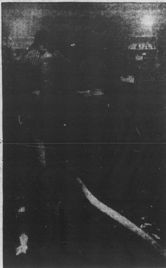
Inside The Gift Shop