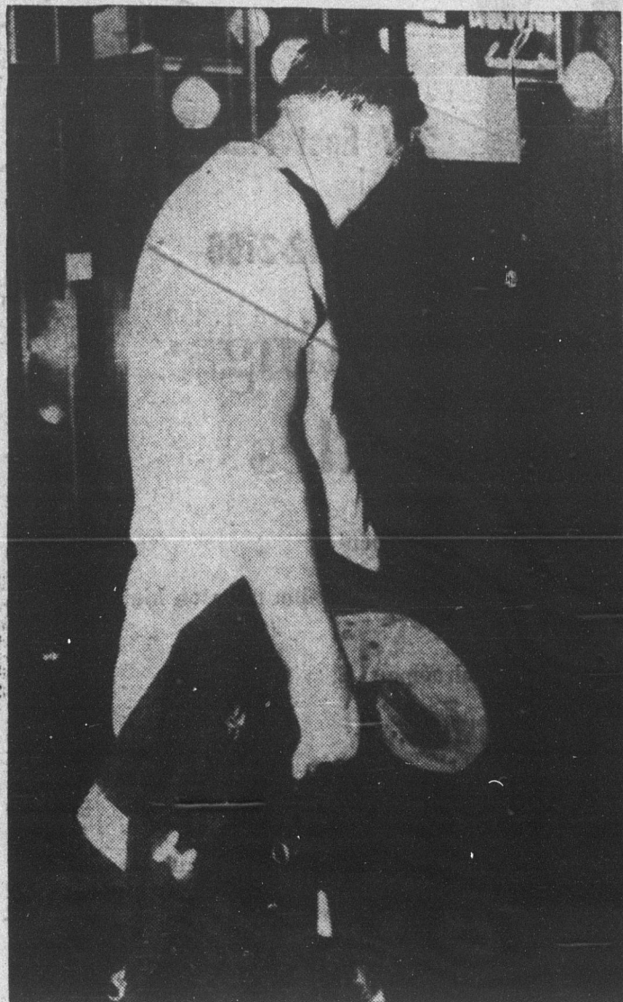
Inspecting The Damage