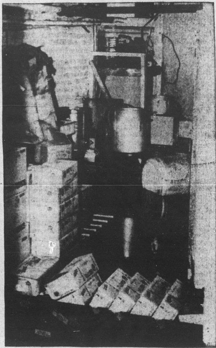
Flooded Storage Bin