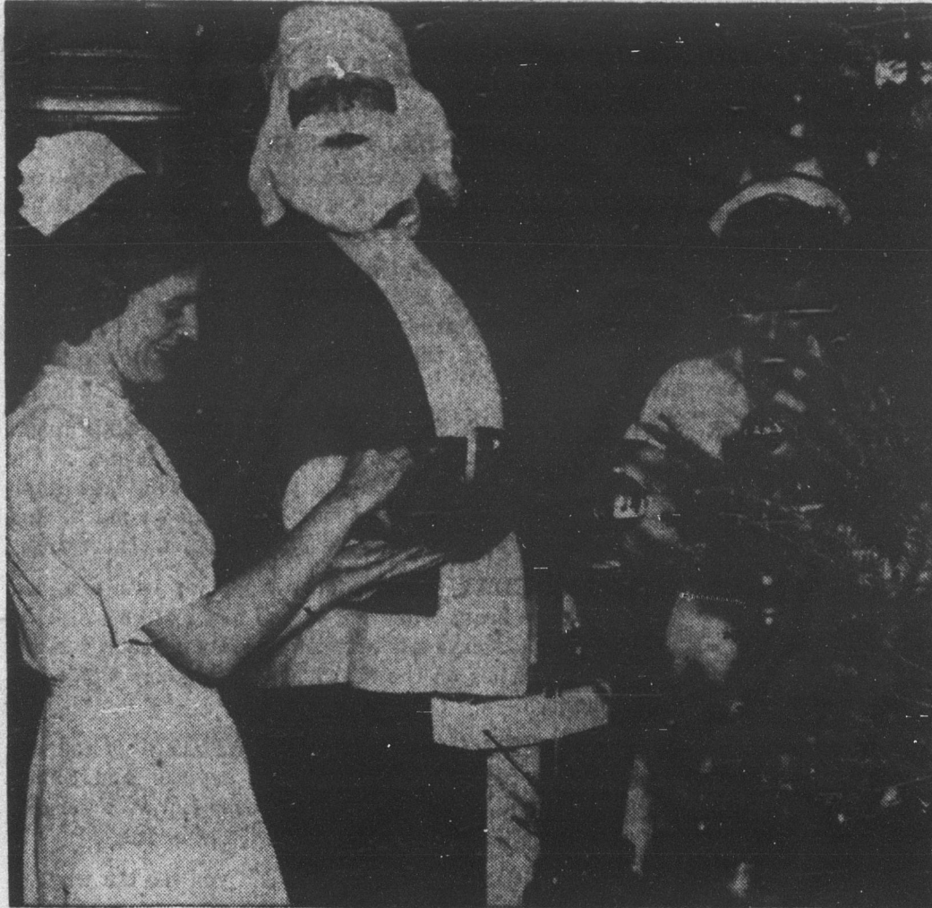
PAUNCHY SANTA —Santa Claus got a pre-Christmas physical examination at Memorial Hospital this week. If he was worried at all about his weight and the circumference of his mid-section, he jolly well concealed it. Checking Santa's pulse and his weight