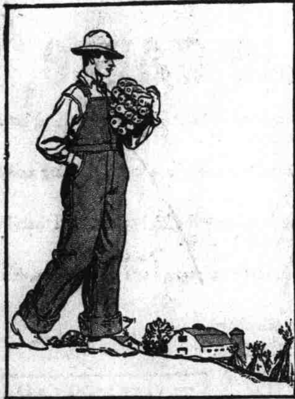
"Plowing—reaping—no matter what the farm work—Blue Buckles are the overalls to wear." (Signed) Fred McCulloch Leading corn grower of Hardwick, Ia., who raised an 88-bushel-per-acre crop.