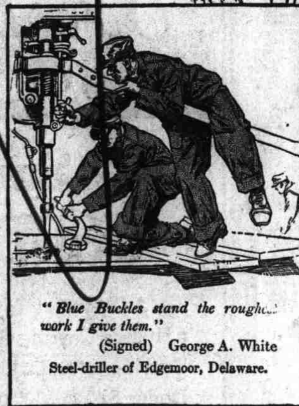
"Blue Buckles stand the roughest work I give them." (Signed) George A. White Steel-driller of Edgemoor, Delaware.

P UTTING a hundred acres into garden truck—working on a thirty-story skyscraper—dashing along the rails in the cab of the Twentieth Century—every one of these workers is doing a different kind of job.