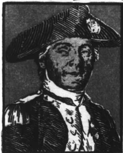
John Paul Jones

JONES WAS A SCOTCHMAN WHO HAD BECOME WARPLY ATTACHED TO AMERICAN IDEAS FOR INDEPENDENCE, AND AT THE OUTBREAK OF THE REVOLUTION PUT HIS SERVICES AT THE COMMAND OF THE CONTINENTAL CONGRESS.