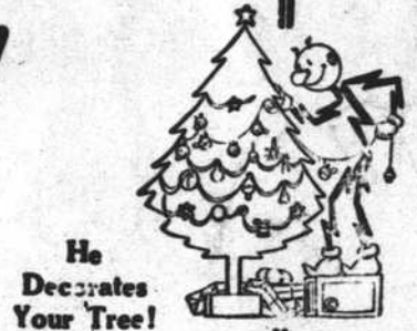
He Decorates Your Tree!