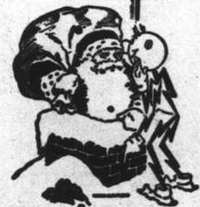
He Works Close With Santa!