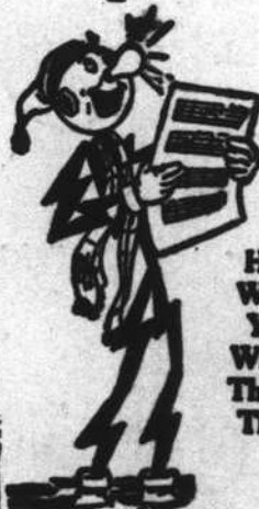
His Gifts Will Make You Sing With Cheer Throughout The Year!