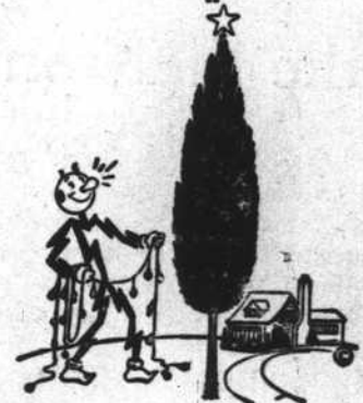
He Brings Christmas Cheer To Your Home!