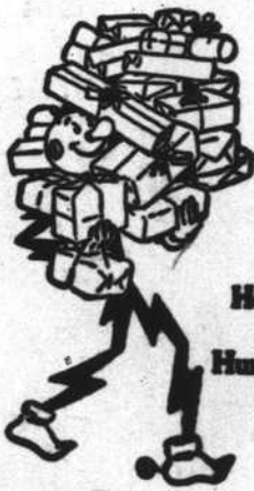
He Brings You Hundreds of Gifts!