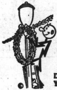
He Decorates Your City

We don't know of anyone who could so satisfactorily play Santa Claus for you . . . as little Reddy Kilowatt! He's such a willing helper and so versatile, too! Just glance around this page and note the many ways he makes your Christmas happier, cheerier and better all around. His gay, twinkling lights make us know that the holiday season is here . . . his thousands of practical and acceptable gifts make your gift buying a joy instead of a problem . . . he will thrill your kiddies with a beautifully lighted tree . . . and with his bright, colorful decorations outside, your home will have that warm hospitality that we all love at Christmas time.