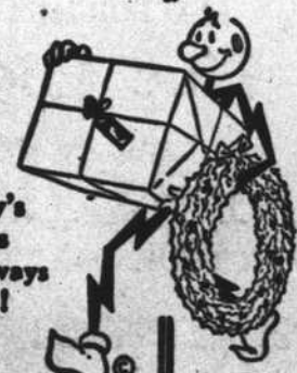
Reddy's Gifts Are Always Best!