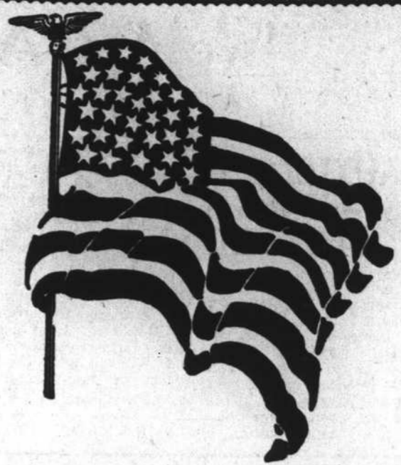
The A. F. OF L. STANDS WITH AND FOR THE FLAG