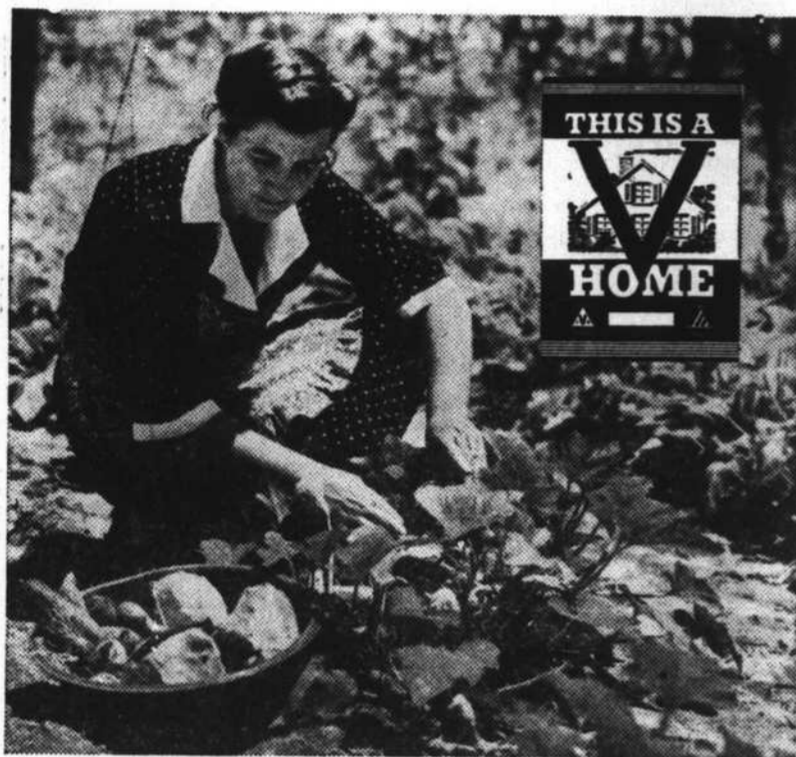
The 1943 Victory Home conserves food by producing its own supply of vegetables. Whether you live in town or on a farm, the Home Victory Garden will insure a healthful diet of vegetables full of vitamins and minerals.

Vegetables for the Family Help Make V-Home