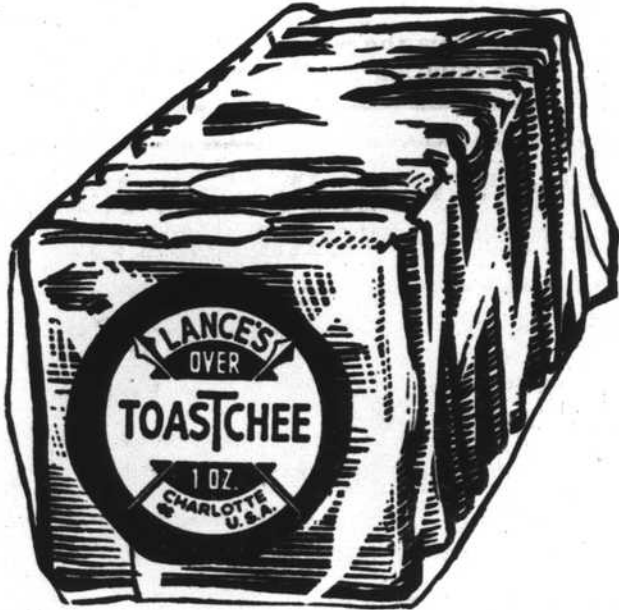
HOUSE OF LANCE