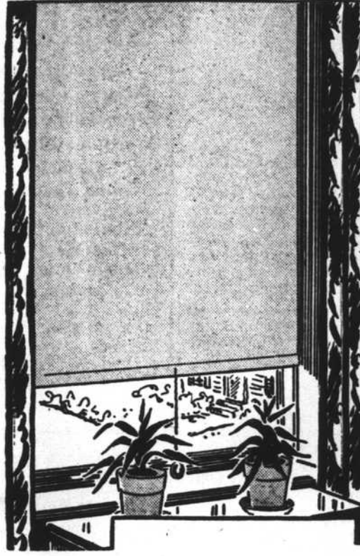
WINDOW SHADES—THIRD FLOOR