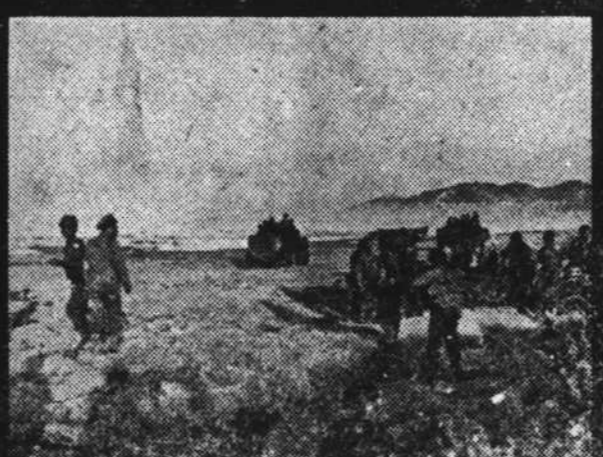
"... and claw their way into a hostile coast." (Sicily)