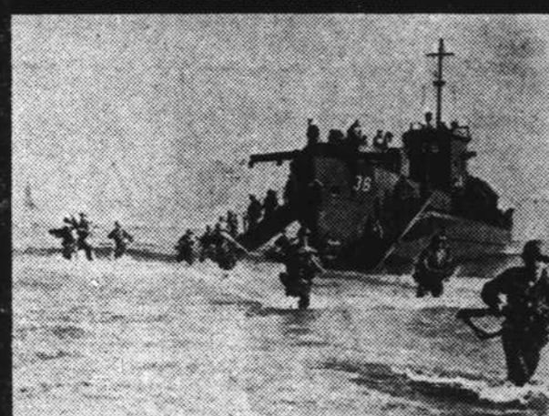
"... they jump from landing barges to a beach ..."