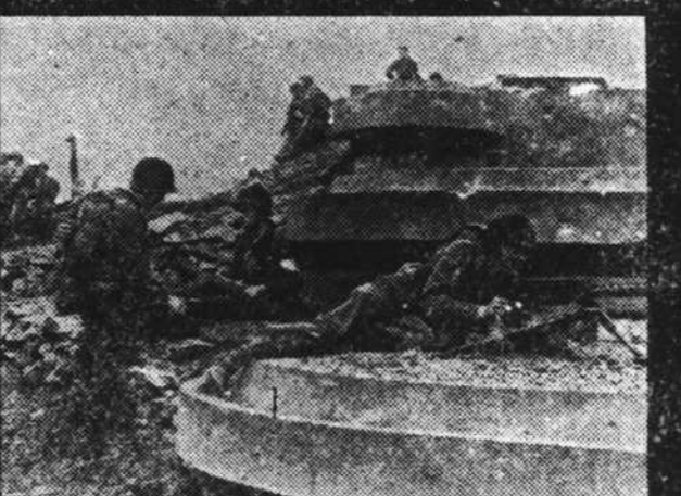
"... to get this horrible thing over with ... quickly ..."