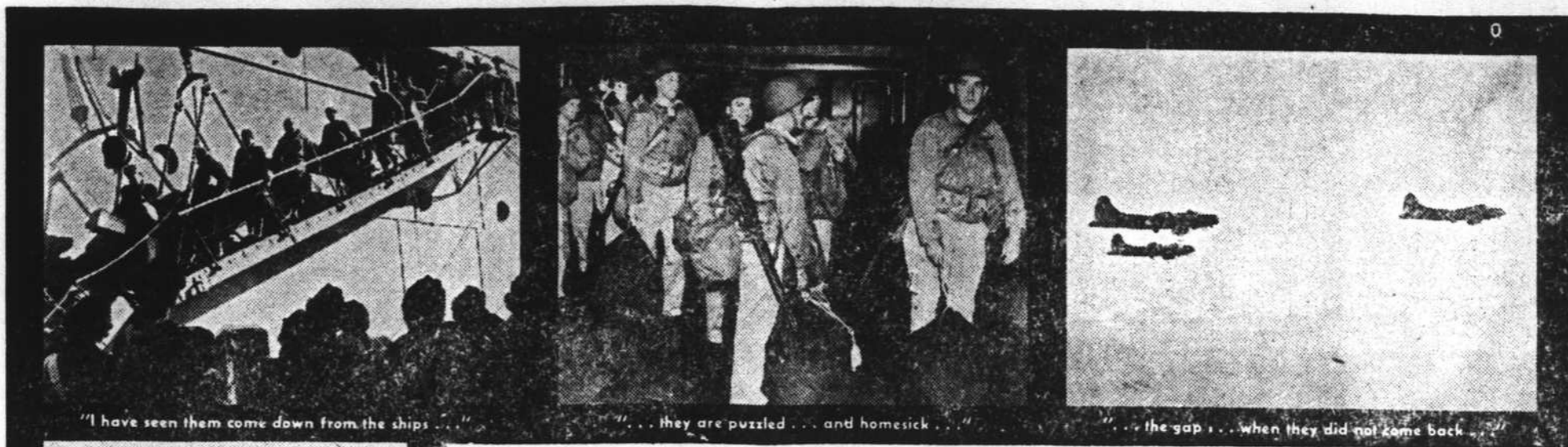
"I have seen them come down from the ships ...

SAVE WITH U. S. WAR BONDS EVERYDAY ... EVERY PAYDAY ... AT LEAST 10% AND MORE!