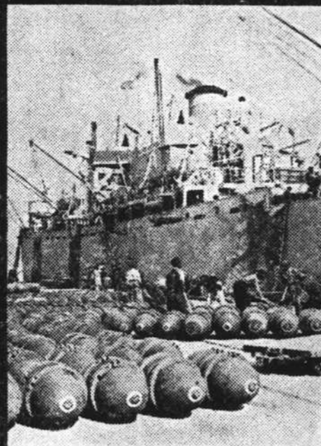
"... I have seen the supplies come in ..."