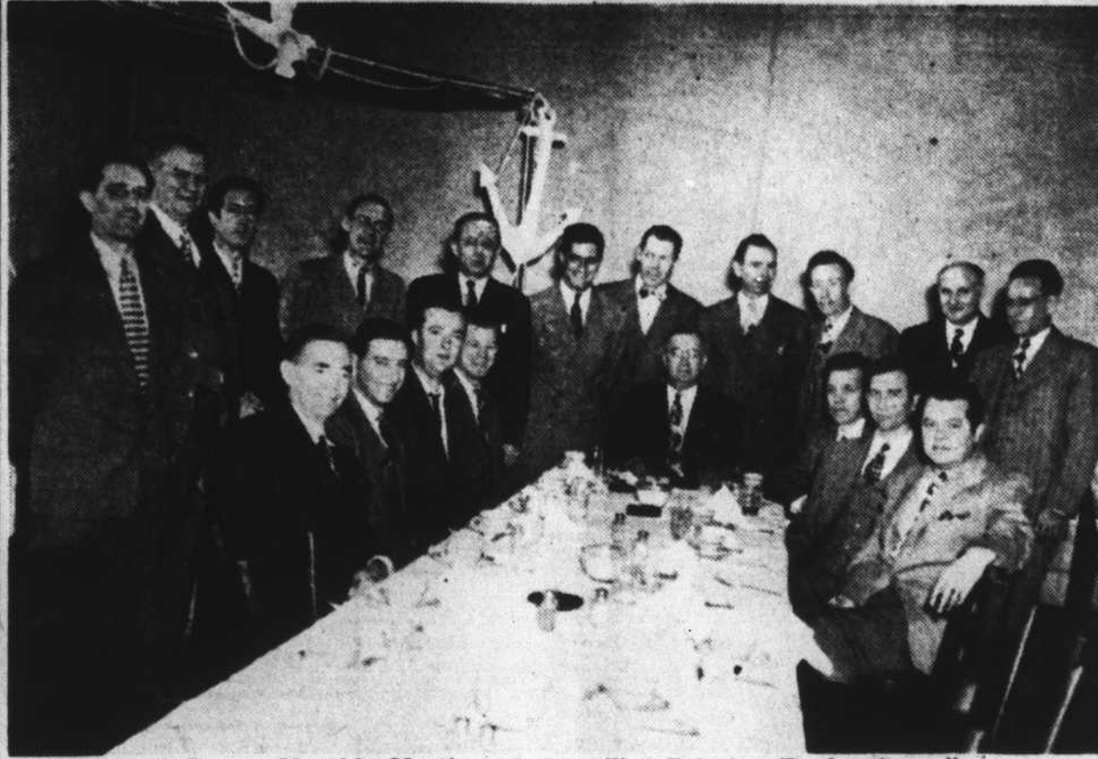
A Recent Monthly Meeting of the Allied Printing Trades Council