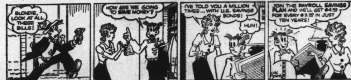
After this, the pencil rendering is carefully inked in, as you see here.