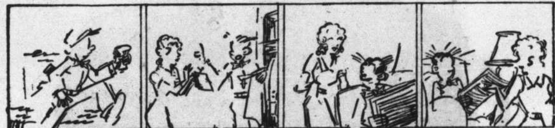
This is how Chic Young, the cartoonist, makes a first rough sketch for the famous strip.

★ IN OUR 55th YEAR OF SERVICE TO CHARLOTTE AND THE CAROLINAS