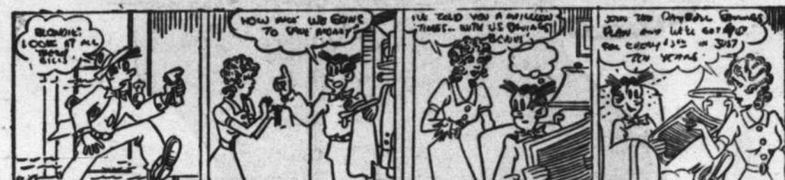
Then when each panel in a strip meets his approval, he makes a careful pencil rendering as above.