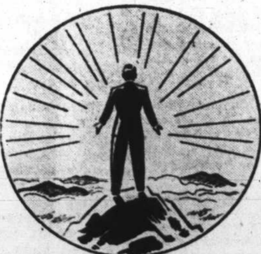
"REWARD for initiative."