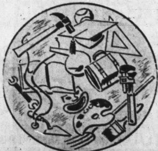
"Our right to choose."