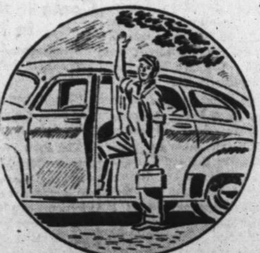
"Labor's right to organize and bargain."

FREE Send for this valuable booklet today!