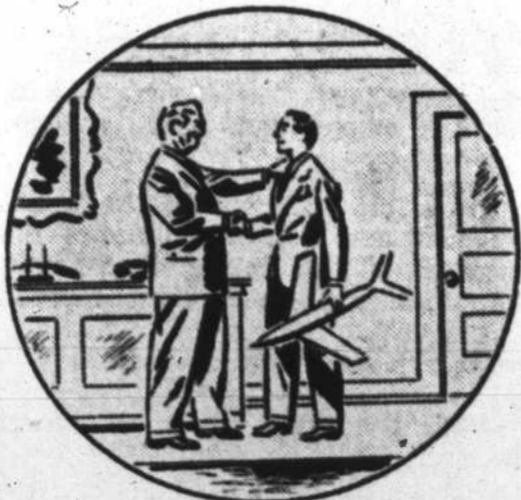
"Our willingness to invest."