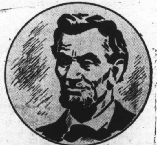
"Free government—of the people—by the people—for the people."