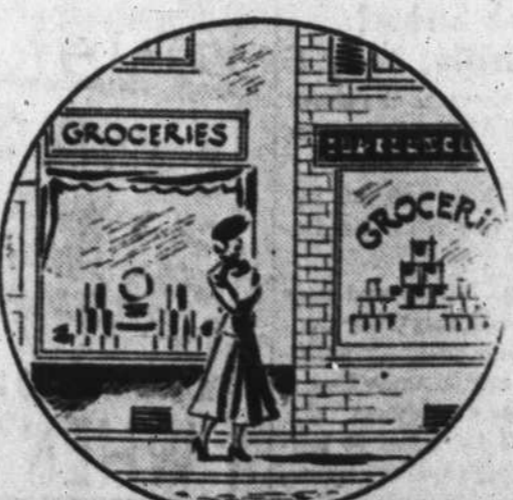
"Free Markets and competition."