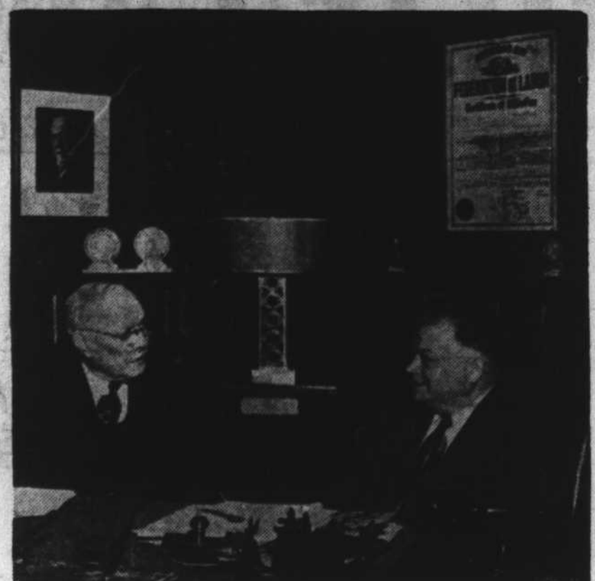
New York.—AFL President William Green and President David Dubinsky of the International Ladies Garment Workers appear for a few moments at end of the ILGWU's sock film, "With These Hands." Above President Green's head is a photograph of Samuel Gompers, founder and first president of the AFL. Above Mr. Dubinsky is the original AFL charter granted to the ILGWU.

of the American Bar Association, whose supporters stooped to a smear-Graham campaign hideous to behold.