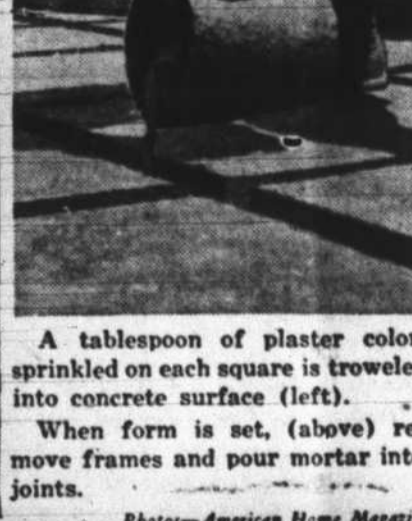
A table spoon of plaster color, sprinkled on each square is troweled into concrete surface (left).