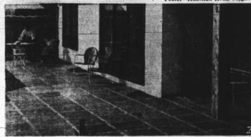
The terrace, above, is made from a form made of sixteen 22-inch squares. No extra preparation of ground is required. Squares are filled with concrete colored with plaster colors to individual taste. Described in detail in the March issue of American Home Magazine, it costs 8 cents a square foot, and a minimum of work to complete.

passed measures and the bills are now in conference.