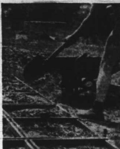
* Greased form, set on levelled ground, is filled with concrete.