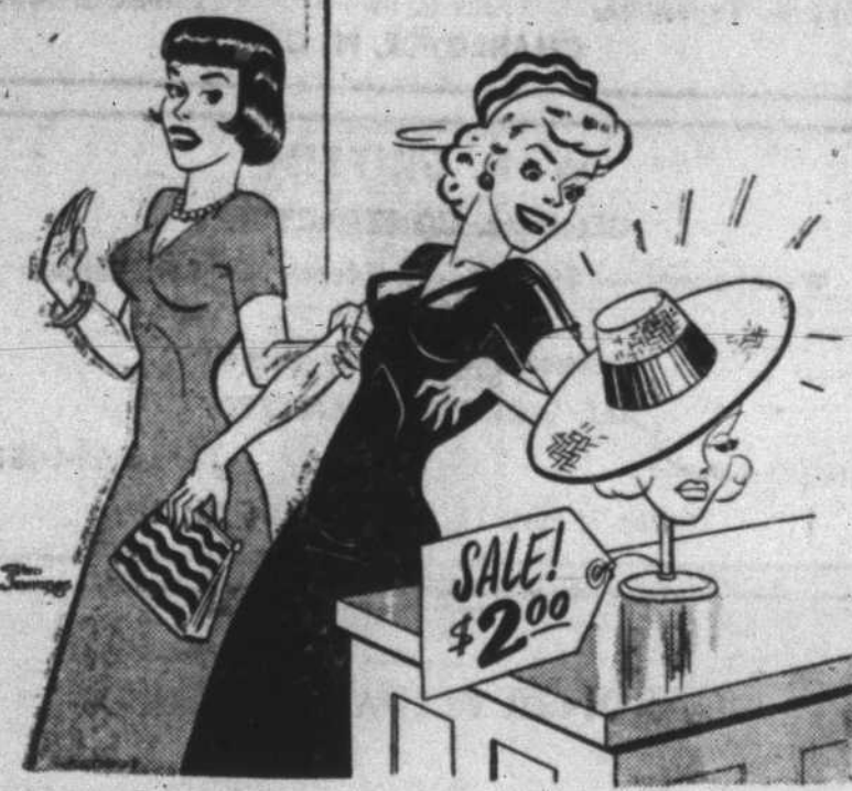
"Nix-nix! L.L.P.E. is a much better buy!"

The Charlotte Labor Journal this week is reviving its Union Label Department, in order that interest in Union Label products may be revived. Back during the war years this feature was dropped because of lack of interest and also due to the fact that so many of the older workers were engaged elsewhere in the war effort and local correspondents were few. However, the old-time spirit is being revived on a national scale, and much material is being received.