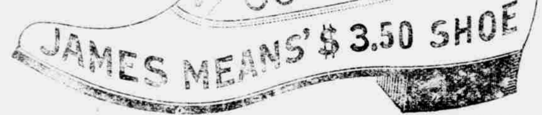
FULL LINE OF ABOVE GOODS FOR SALE BY

BOOTS AND SHOES MANUFACTURED BY JAMES MEANS & CO. OF BOSTON ARE UNEXCELLED. THEY ARE MADE IN ALL STYLES, SIZES AND WIDTHS.