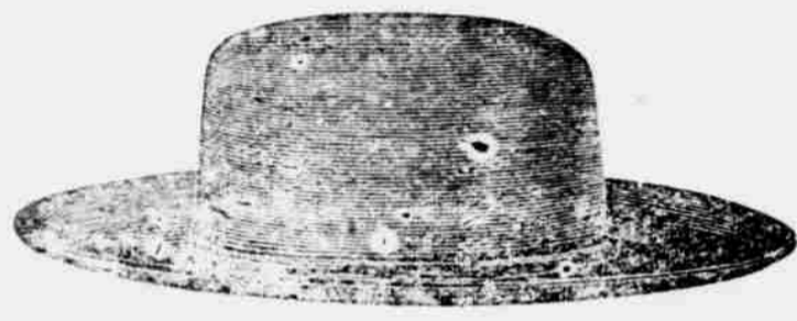
"THE PLANTER'S PRIDE."