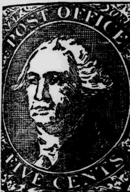
Fifty Years Ago.