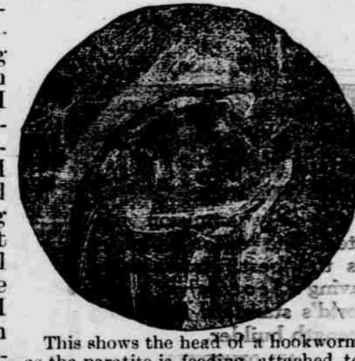
This shows the head of a hookworm as the parasite is feeding, attached to the wall of the bowels.