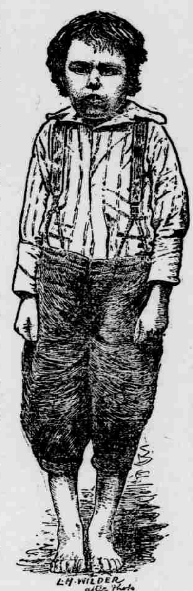
Boy 18 years of age suffer- ing from a severe case of hook- worm infection. Growth greatly retarded, suffered from palpitation of heart and stom- ach trouble; gets out of breath easily.

VICTIM OF HOOKWORM DISEASE DESCRIBES HIS FEELINGS. "I feel tired all the time almost, and get tired very easi- ly, and have little or no energy. My spirits are low almost all the time. I feel full after eating. My memory is poor. I feel that I am getting weak- er. I have a disgust for fat- ty foods. I prefer being alone rather than to be in the company of others. I have no desire even to con- verse tete-a-tete with the la- dies. After taking a walk I feel broken down and tired all over, feel more like lying down than anything else. It tires me very much to stand any length of time. In the morning when getting up I feel tired and broken down also. Under these condi- tions I am not able to do