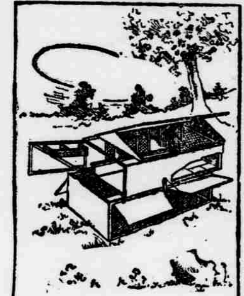
Useful Poultry House.

A rather elaborate poultry house has been designed by a New York man. It is in two sections, one of which slides upon the other and is small enough to be easily taken apart. The lower section has screens along