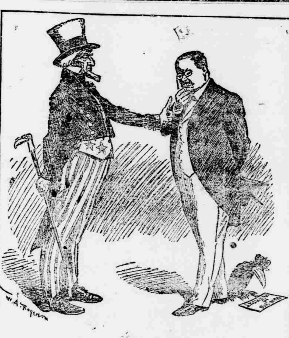
Uncle Sam—"Honestly, What Are You Running for, the Presidency or for Revenge?"