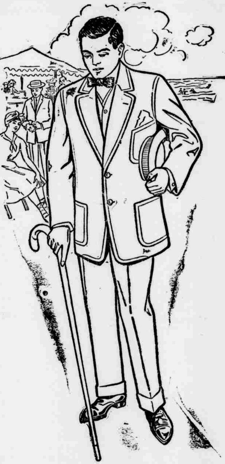
COPYRIGHT 1912, THE ROYAL TAILOR

This is a prescription prepared especially for MALARIA or CHILLS & FEVER . Five or six doses will break any case, and if taken then as a tonic the fever will not return. It acts on the liver better than Calomel and does not gripe or sicken. 25c