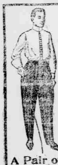
A Pair of Trousers