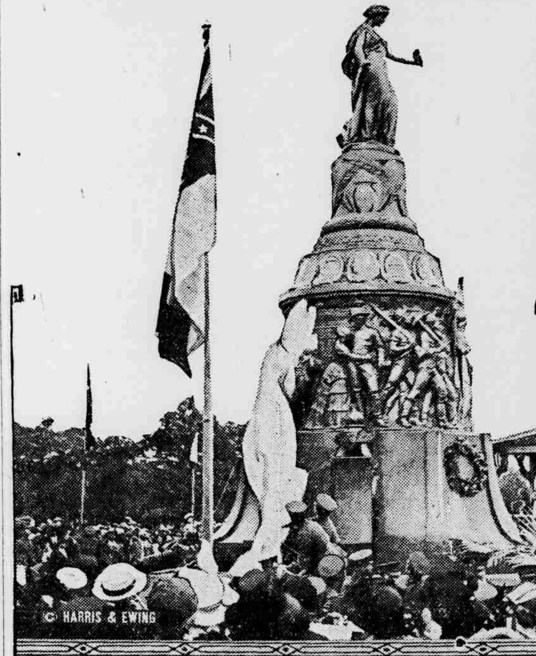
View of the monument to the Confederate dead in Arlington National cemetery as it looked just after the unveiling, in which President Wilson took part. The monument is of brotze and stands on a base of dark gray polished granite. Sir Moses Ezekiel was the sculptor.