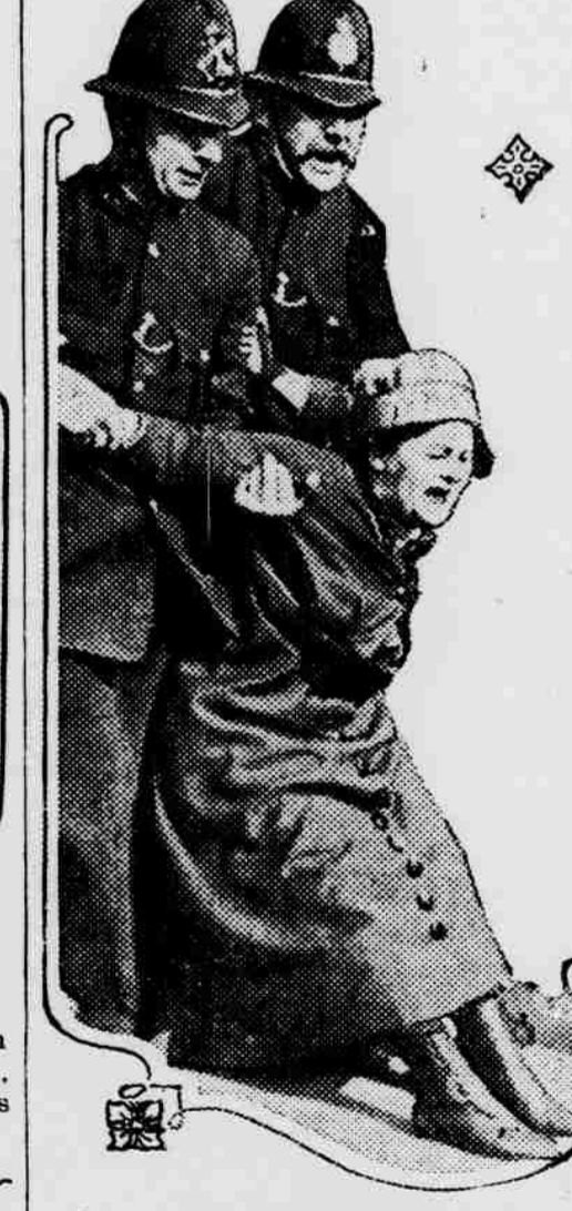
One of the militant suffragists who attacked the gates of Buckingham palace struggling in the grasp of the "Bobbies" that frustrated the raid. The women have so exasperated the authorities in London that the police now handle them as they would male offenders.

A Cheering Effect. "What influence has cubist art had on civilization?" "Well," replied the eminent alienist, "it has had a refining influence out at our asylum. A number of rooms that used to be referred to as cells are now called studios."