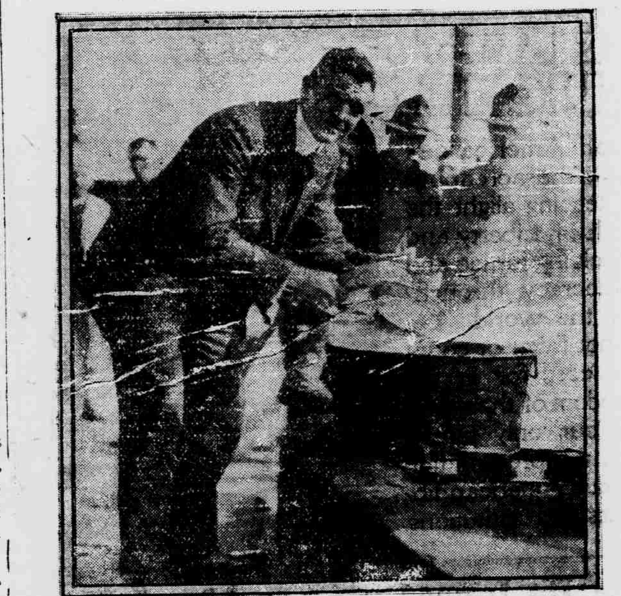
Christopher Mathewson the great baseball pitcher and baseball player known to all as Matty, paid an unexpected call on the boys in training at Camp Sheridan, Montgomery, Ala. He dined soldier fashion with the boys and after mess washed and dried his own dishes.