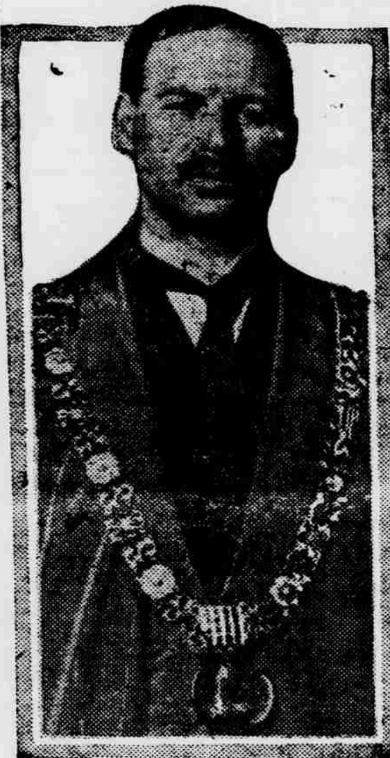
LAWRENCE O'NEIL, LORD MAYOR OF DUBLIN.

Lawrence O'Neil has just been installed as the new Lord Mayor of Dublin, and this photograph shows him in his robes of office.